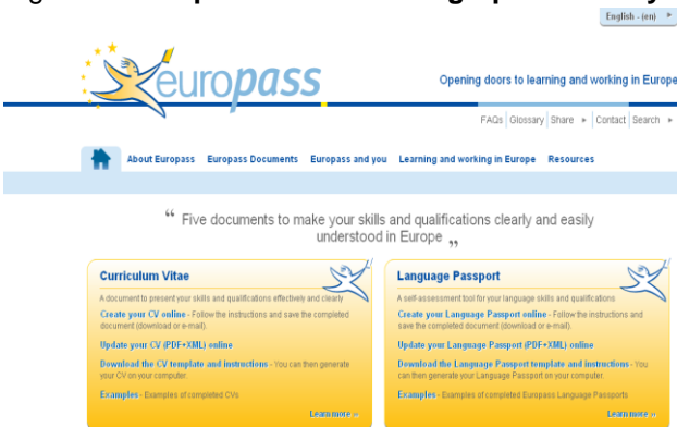
Figure 2: Europass website new graphic identity

For more than seven years the key to Europass' success has been easy access. In December 2011, the website was given a new graphic identity providing quicker access to information (Figure 2). By the end of 2012, the Europass website will introduce a new CV. New web services will also improve interoperability between Europass and other websites, for example making it easier to save the Europass CV on a job portal.